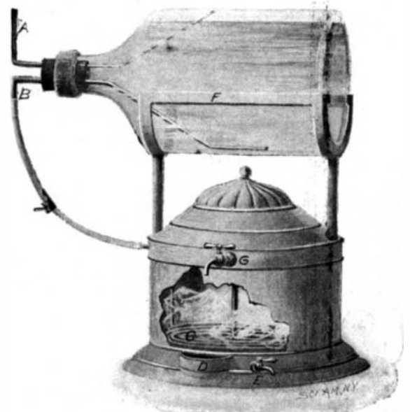
A NEW FORM OF WATER COOLER.

This form of water cooler embodies many excellent advantages. Primarily, of course, the water is cooled without being contaminated by contact with the ice. Again, only a small amount of water is cooled at a time, so that when a fresh bottle has been connected up, one does not need to wait until its entire contents have been cooled before obtaining a glassful of cold water. Mr. Conover's cooler will further be found very economical in its consumption of ice. Aside from these, other advantages which our limited space prevents us from enumerating, will readily suggest themselves to our readers.