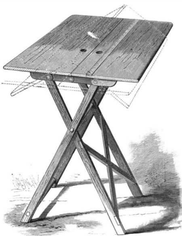
FREEBORN' FOLDING STAND.