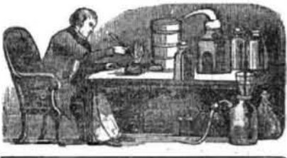
For the Scientific American.